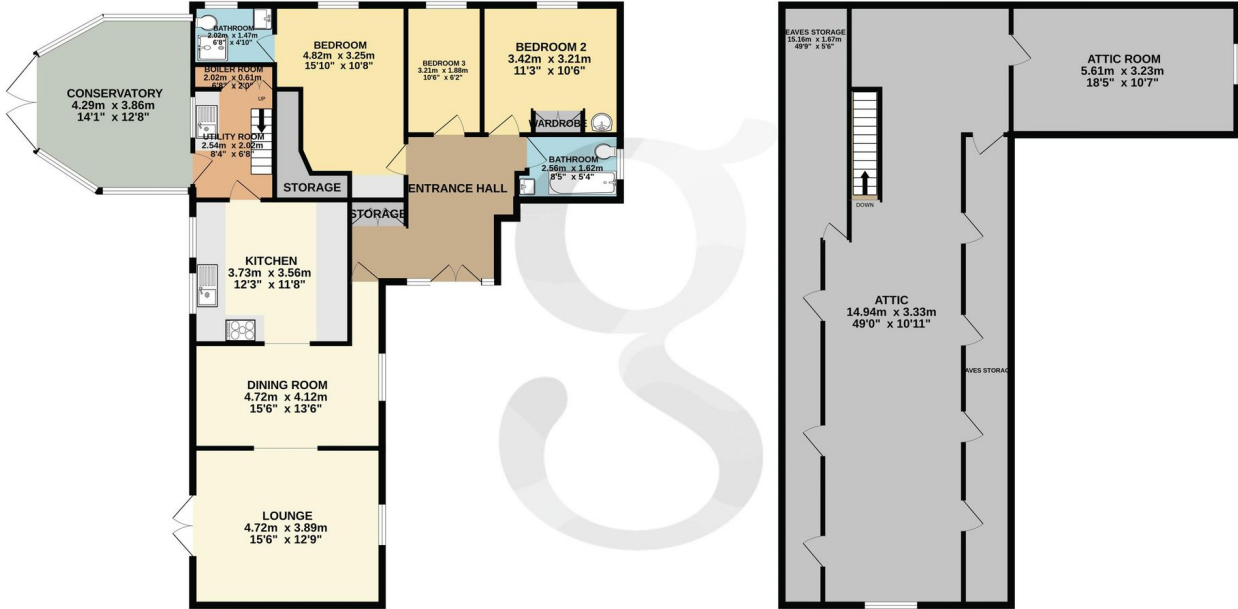
TOTAL FLOOR AREA: 221.2 sq.m. (2381 sq.ft.) approx.

Whilst every attempt has been made to ensure the accuracy of the floorplan contained here, measurements of doors, windows, rooms and any other items are approximate and no responsibility is taken for any error, omission or mis-statement. This plan is for illustrative purposes only and should be used as such by any prospective purchaser. The services, systems and appliances shown have not been tested and no guarantee as to their operability or efficiency can be given.