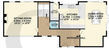
GROUND FLOOR 157.2 sq.m. (1692 sq.ft.) approx.