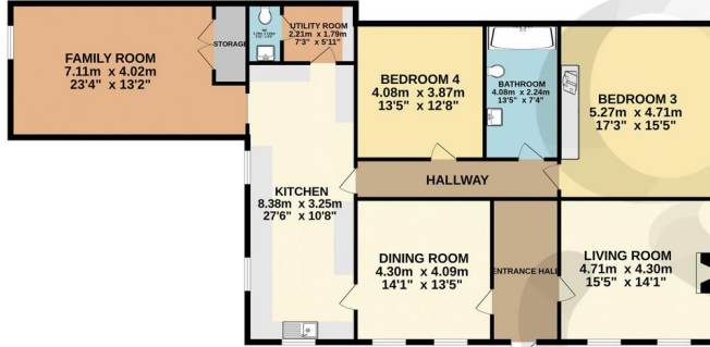
GROUND FLOOR 164.5 sq.m. (1771 sq.ft.) approx.