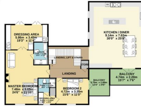
1ST FLOOR 176.00m (176.00m approx.)