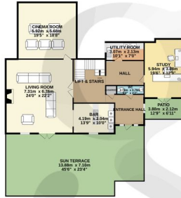
GROUND FLOOR 200.00m (200.00m approx.)