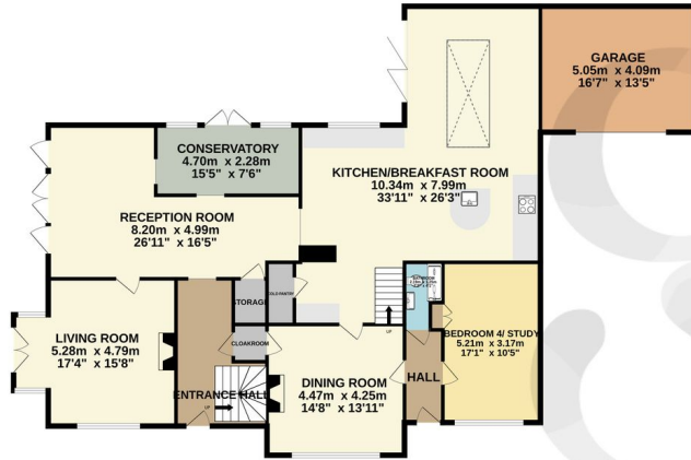
GROUND FLOOR 198.9 sq.m. (2141 sq.ft.) approx.