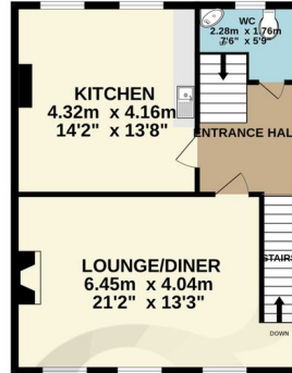
1ST FLOOR 53.0 sq.m. (570 sq.ft.) approx.