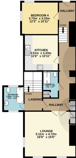
1ST FLOOR 82.7 sq.m. (890 sq.ft.) approx.