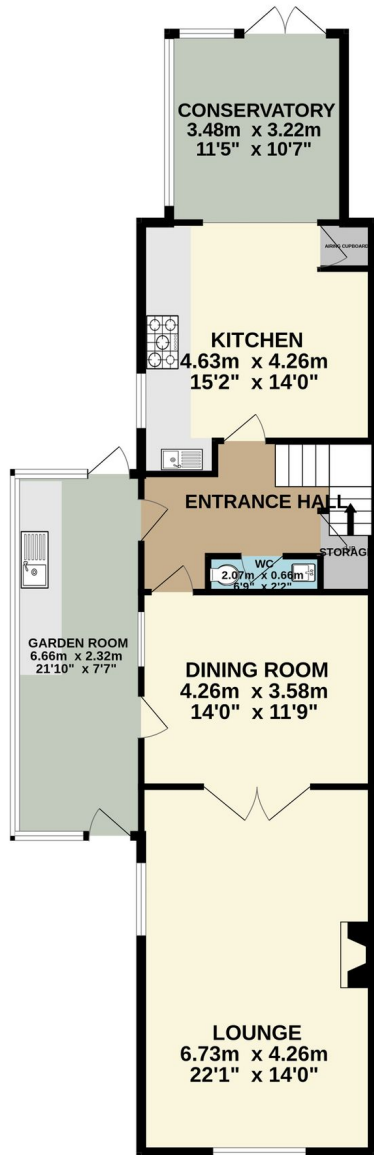
GROUND FLOOR 99.0 sq.m. (1066 sq.ft.) approx.