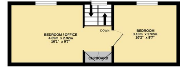
2ND FLOOR 23.4 sq.m. (252 sq.ft.) approx.