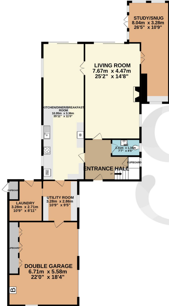
GROUND FLOOR 161.4 sq.m. (1737 sq.ft.) approx.